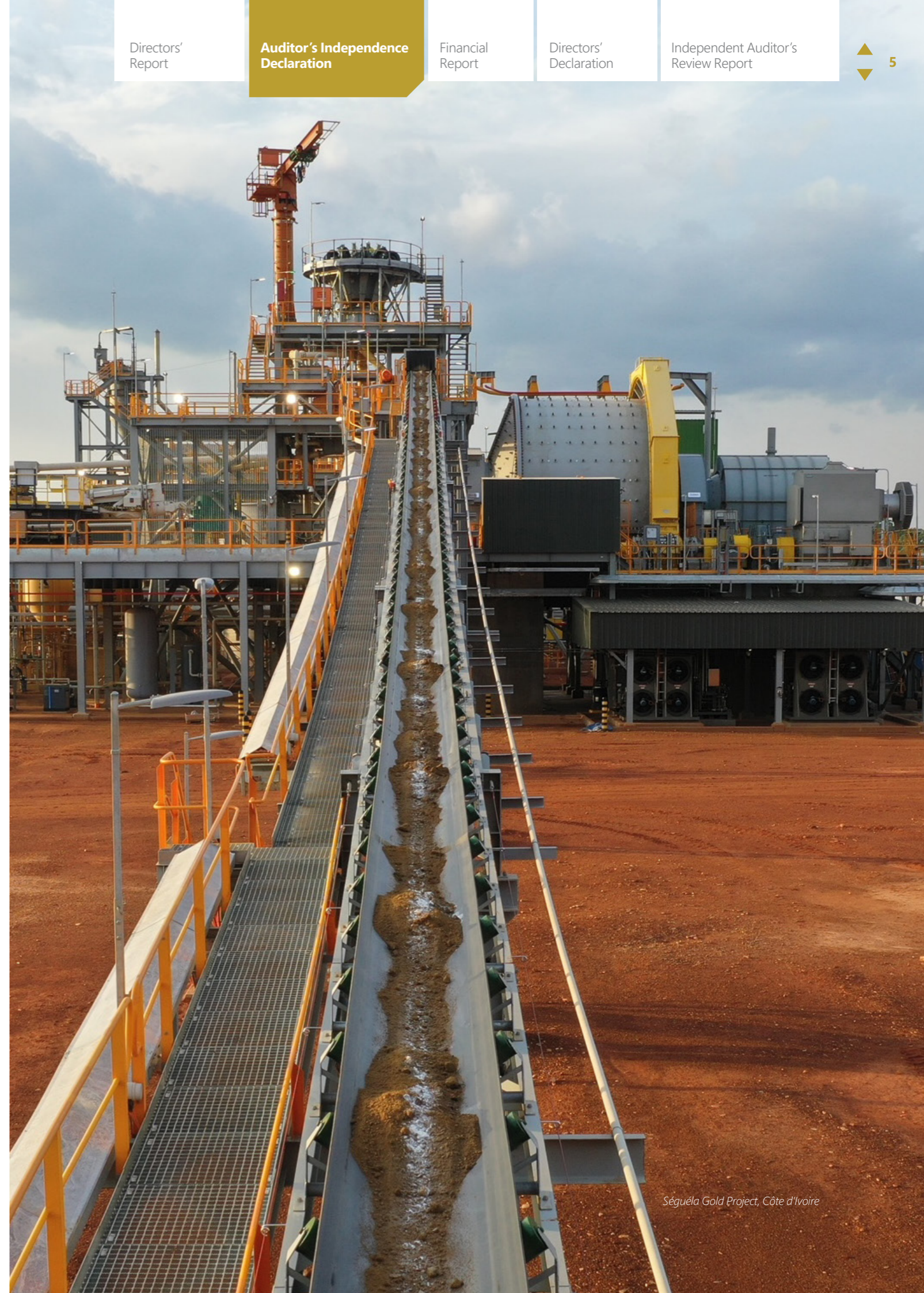
Séguéla Gold Project, Côte d'Ivoire

RSM Australia Partners is a member of the RSM network and trades as RSM. RSM is the trading name used by the members of the RSM network. Each member of the RSM network is an independent accounting and consulting firm which practices in its own right. The RSM network is not itself a separate legal entity in any jurisdiction. RSM Australia Partners ABN 36 965 185 036 Liability limited by a scheme approved under Professional Standards Legislation