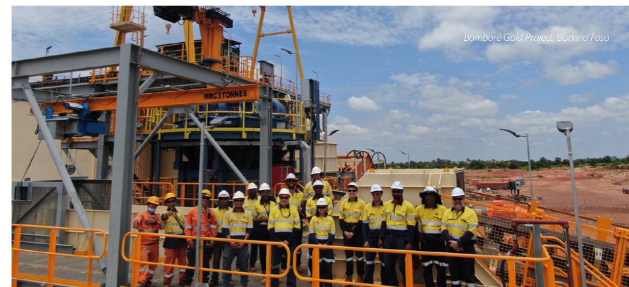
Bomboré Gold Project, Burkina Faso